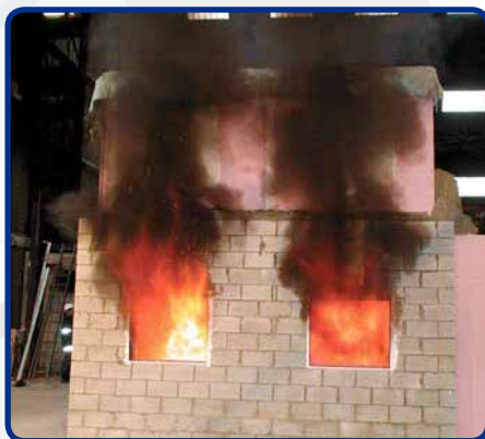
FULL SCALE FIRE TEST

We have commissioned in excess of 60 loadbearing fire tests and over 1000 Acoustic laboratory and field tests.