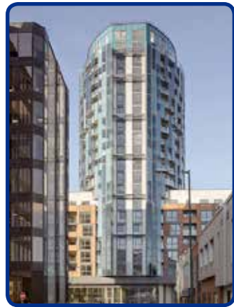
VISION MODULAR BBA, BOPAS & LABC CERTIFIED 25 STOREY MODULAR BUILDING SYSTEM

Our other areas of expertise include those listed below.