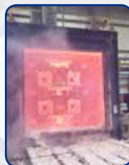
BEFORE AND AFTER PICTURES OF LOAD BEARING EN1365-1 : 2012 FIRE TEST