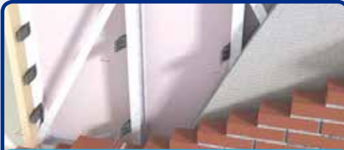
FUSION BUILDING SYSTEMS PATENTED THERMALLY BROKEN WALL TIE BRACKET SYSTEM

We can advise you of the development steps required to bring your construction product to the forefront of the market, keeping you ahead of your competitors, using the principles of the stagegate process.